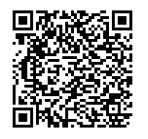
SCAN TO GIVE YOUR GIFT NOW