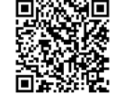
SCAN TO CHECK IN NOW