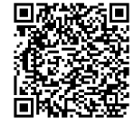
SCAN TO GIVE YOUR GIFT NOW